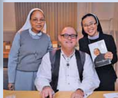
Ronan Tynan with "fans"