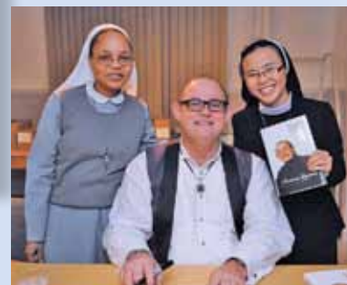
Ronan Tynan with "fans"