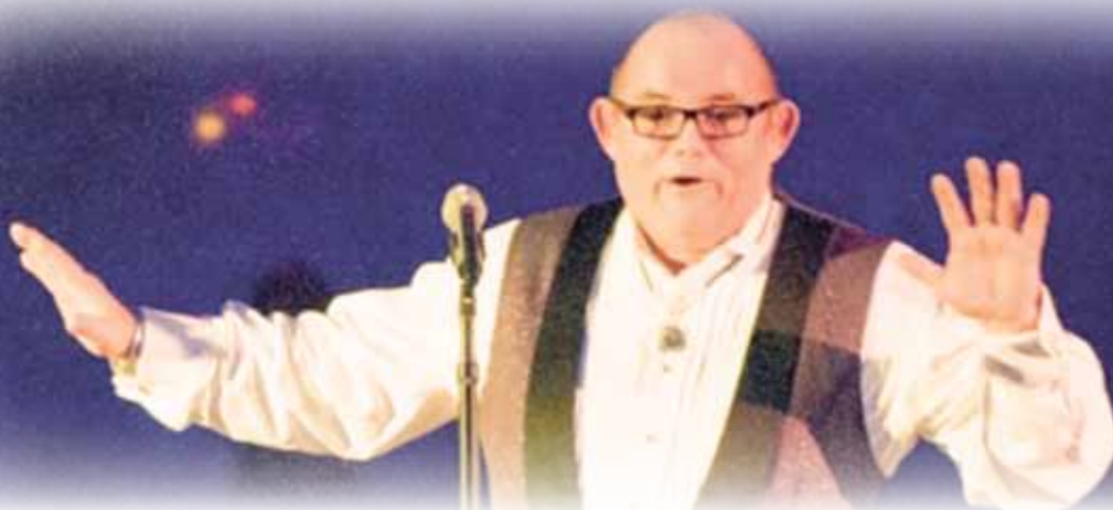
Irish Tenor Ronan Tynan entertained in a benefit concert for Assumption College for Sisters. See page 4 for more Concert pictures.