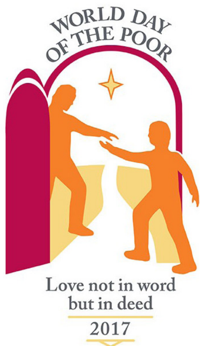
World Day of the Poor Logo