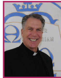
MONSIGNOR GEORGE HUNDT Servant Leader Award