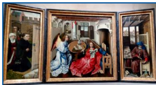
Students of Art History and Appreciation visited the Cloisters, a branch of the Metropolitan Museum of Art located in Fort Tryon Park, NYC. The Sisters had the opportunity to see medieval architecture transported from Europe, as well as numerous paintings and works of sculpture. The Sisters also observed the famous Annunciation altarpiece by Robert Campin.