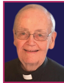
MONSIGNOR HERBERT TILLYER Servant Leader Award