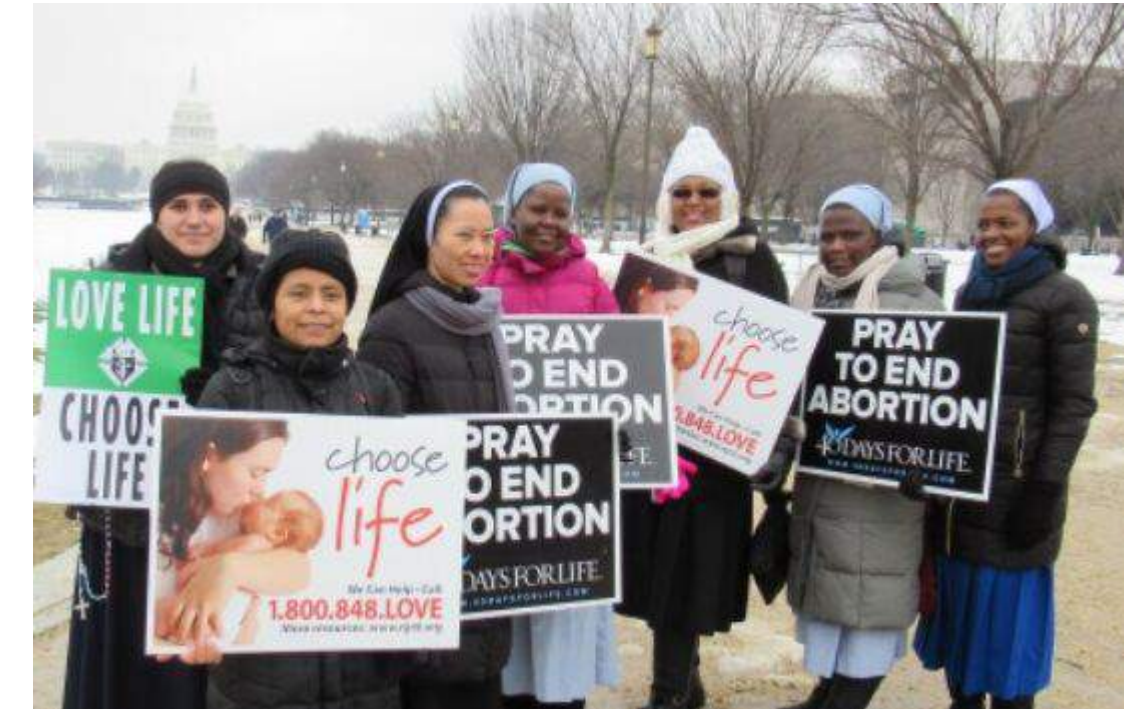
Students represent Assumption College for Sisters at the 45th Annual March for Life, Pro Life Rally in Washington, DC.