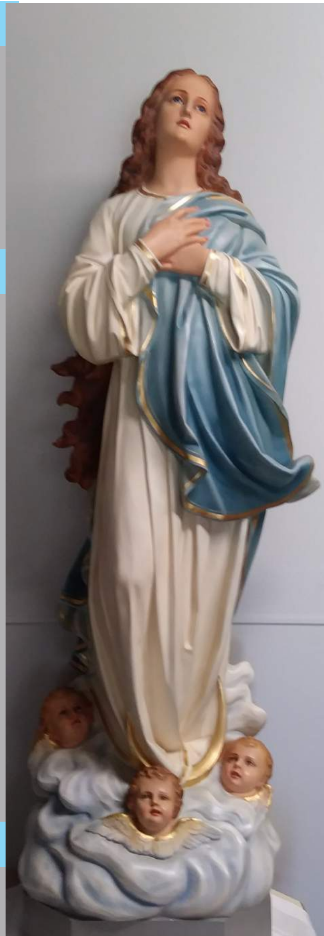
Statue located in Front entrance of ACS