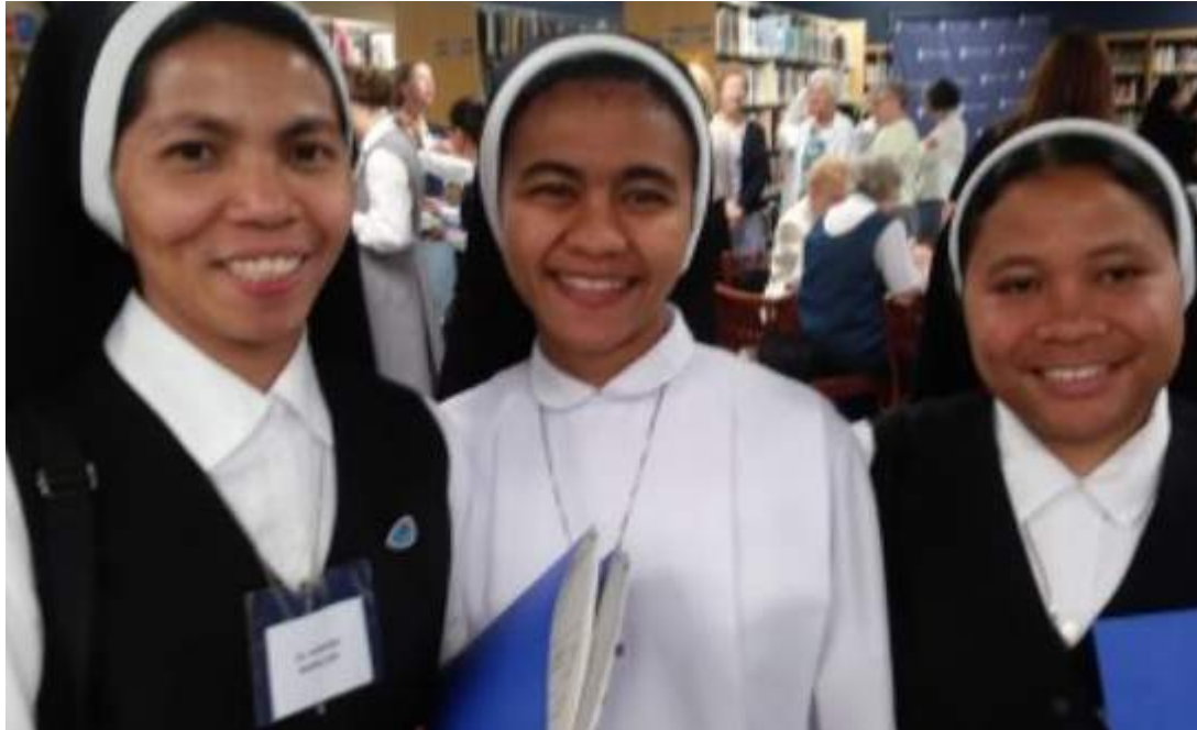
Commuter Students, SDV - Sisters of Divine Vocation, and FSSE - Franciscan Sisters of St. Elizabeth attend Orientation.