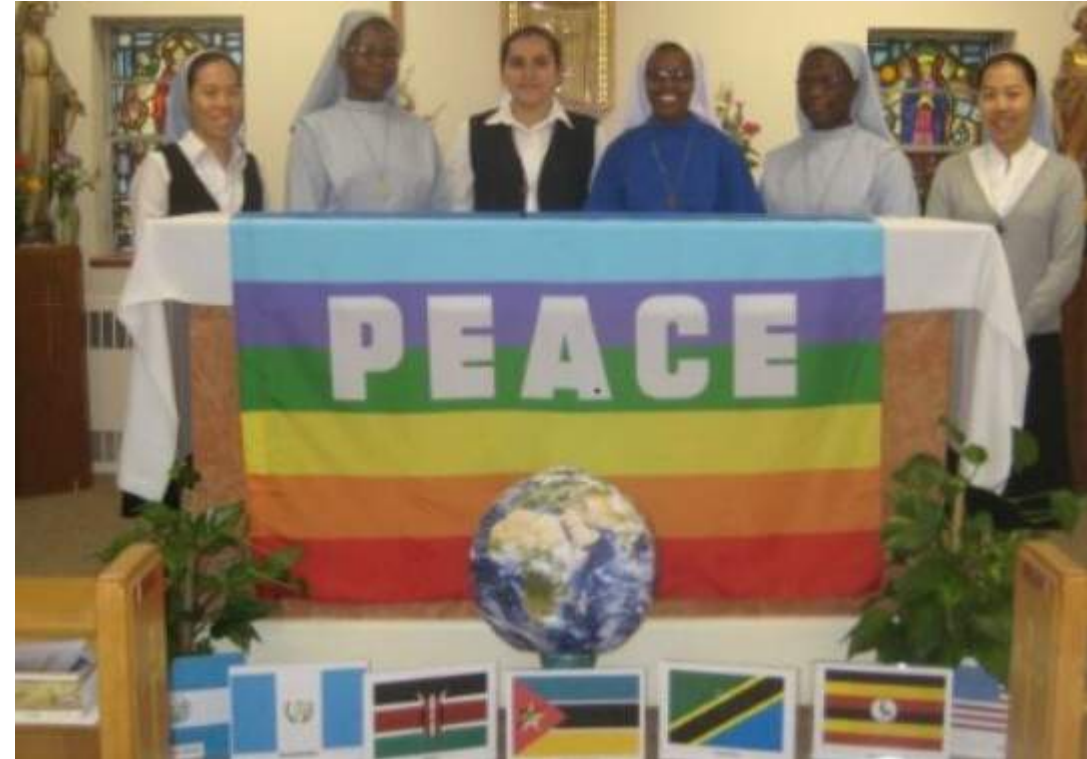
International Peace Day September 21st, is celebrated in the convent chapel for the purpose of fostering peace throughout the world.