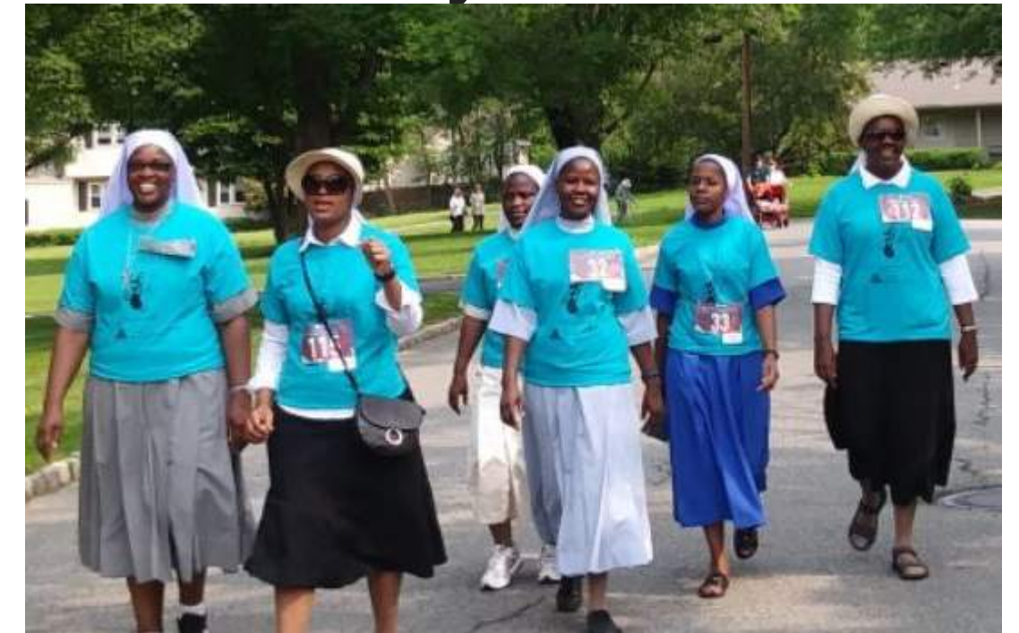
ACS students join Sisters of Christian Charity in their annual Run for a Nun fundraising event.