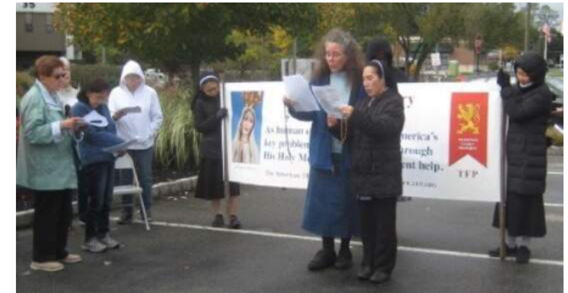
Students from ACS, St. Mary's, St. Clement's and other neighboring parishes join together to pray the rosary asking God, through the holy rosary, to save America and to return her to Judeo-Christian values.