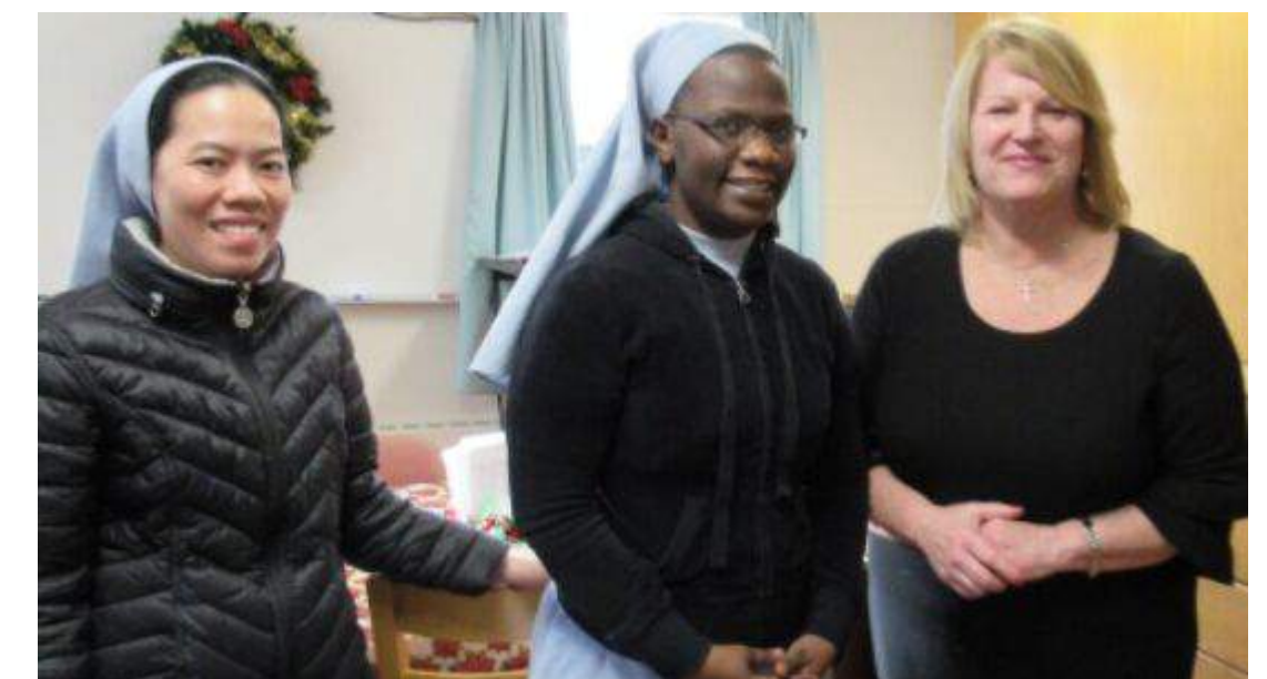
Long Valley Columbiettes bring gifts of household supplies and personal items.