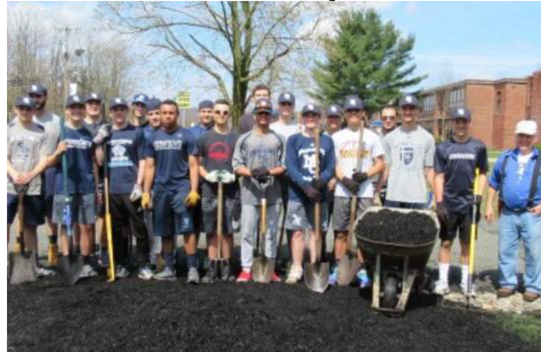
Volunteers from Morris Catholic High School assist ACS Trustees in beautifying the campus.