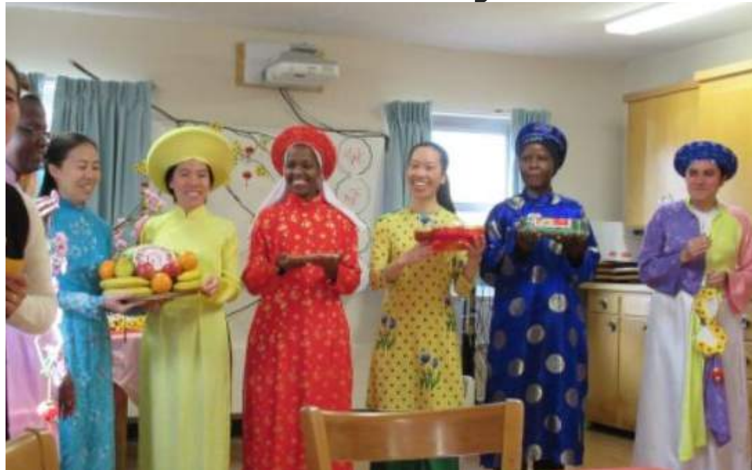
At ACS, New Year (Tet) wishes are exchanged (chúc mừng năm mới) "lucky money", wrapped in red envelopes, hang on handmade trees.