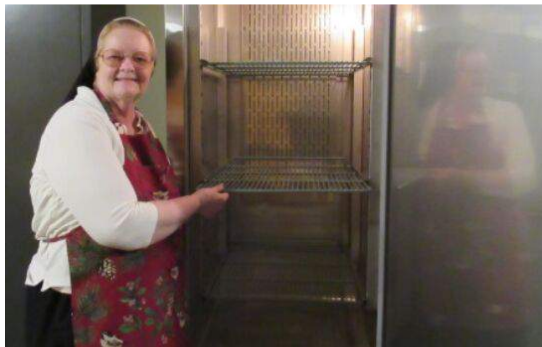
Giving Thanks for GIVING TUESDAY. We are able to purchase a new commercial grade refrigerator as well as stock it!