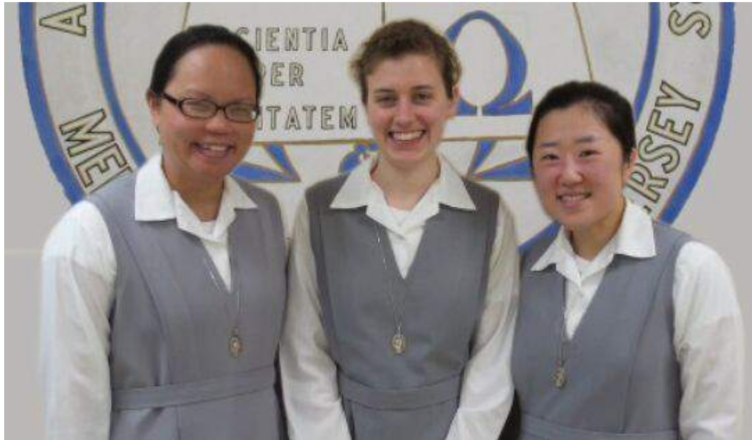
2019 Graduates: Certificate in Theological Studies

Certificates in Theological Studies Awarded