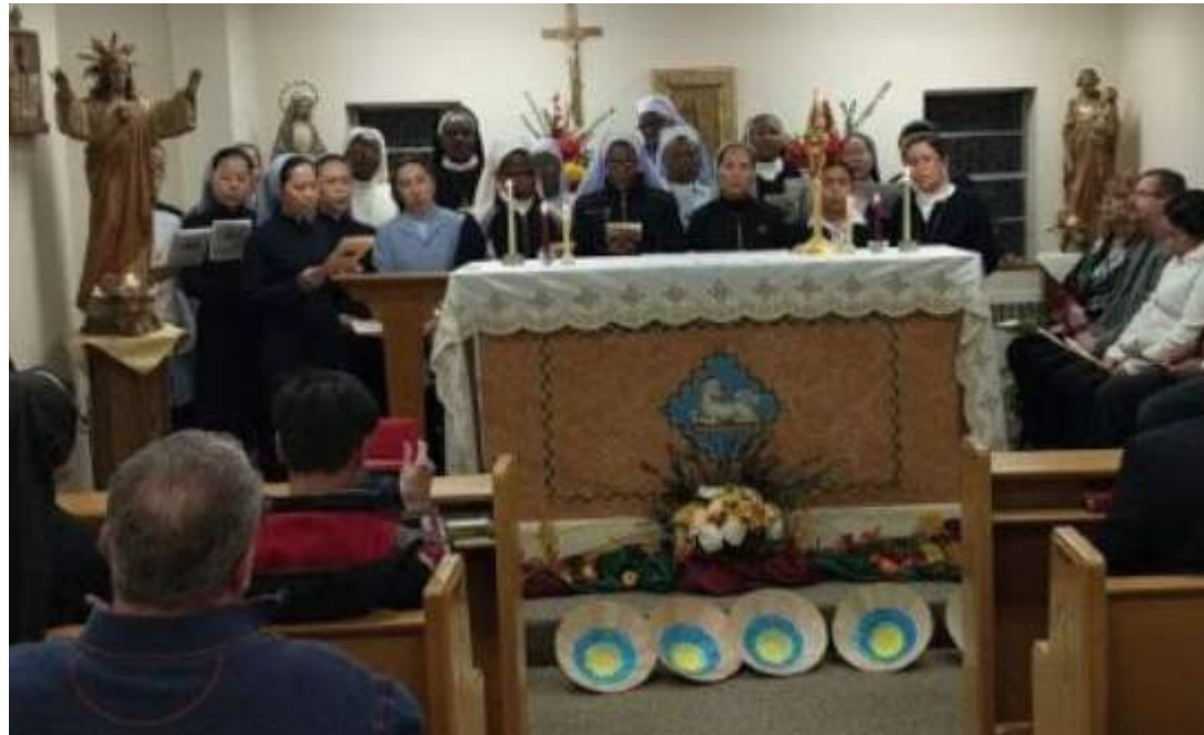
Thanksgiving Vespers with Sisters and friends is followed with a reception.