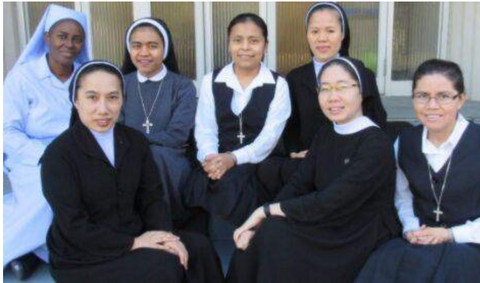
2019 Graduates: AA or ARA Degree