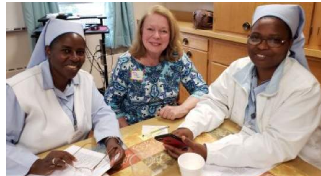
Cornerstone women from St. Joseph Parish in Mendham are paired with the international residential students in our Sister to Sister program.