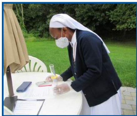
Outdoor Chemistry Lab - A COVID adaptation

The Administration of ACS congratulates the Faculty, Staff and Students for successfully completing in-person instruction throughout the Fall Semester. As faculty and students reinforced their technology skills for occasional remote instruction and creative use of outdoor space as state-approved re-start protocols were adhered to, quality instruction continued to take place. It is the hope and prayer that conditions in 2021 will improve and all will remain safe and healthy.