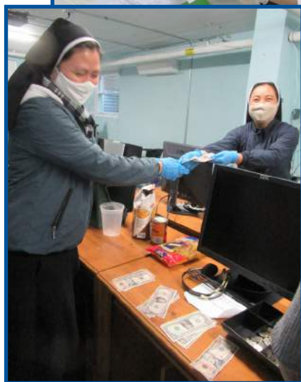
Top: Outdoor Study Session Basic Math Students learn US currency