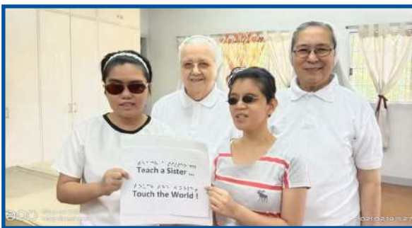
Students and Sisters from Margrethe Home for the Blind, Manilla, Philippines join in the Virtual Caring Basket Gala