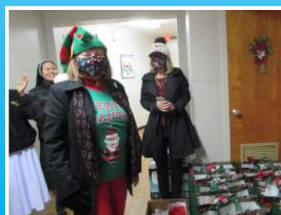
Gifts from Friends from Our Lady of the Mountain, Long Valley