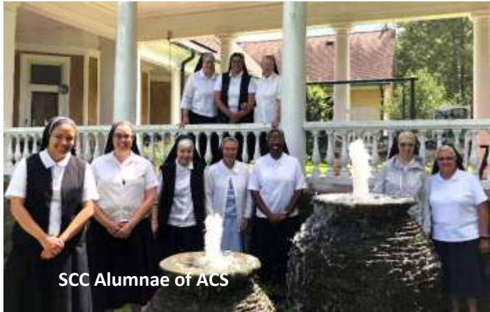
SCC Alumnae of ACS